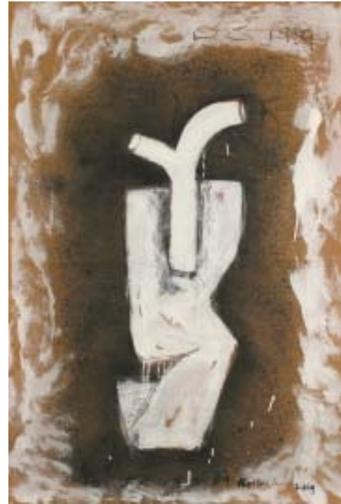
David Smith (1906-1965) Study for ROSATI LANDING 1959 Gouache on Paper 36 x 24 inches