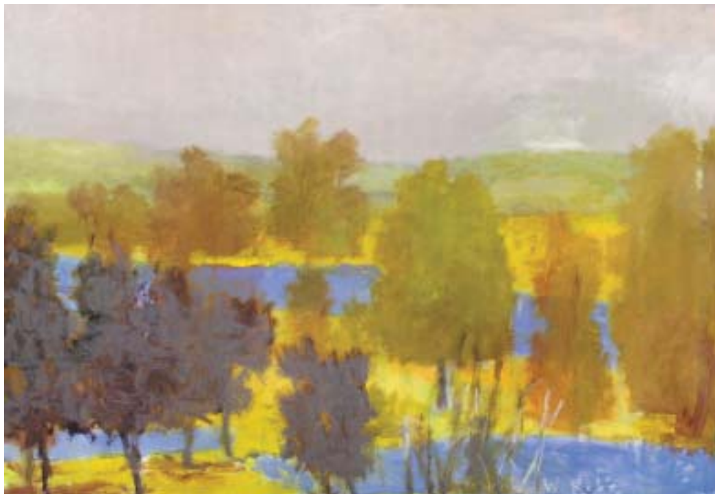
Wolf Kahn YELLOW MEADOWS, BLUE PONDS 2007 Oil on Canvas 36 x 52 inches