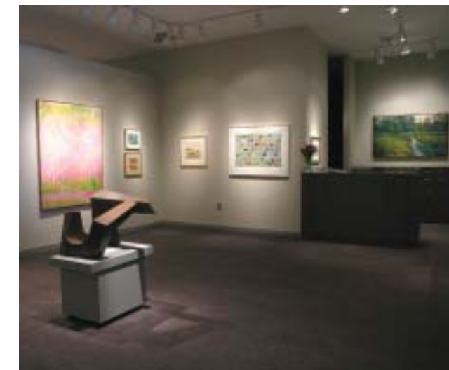
Group Exhibition at Jerald Melberg Gallery.

The exhibition is currently scheduled to open in January 2009. Stay tuned for more exhibition details this fall!