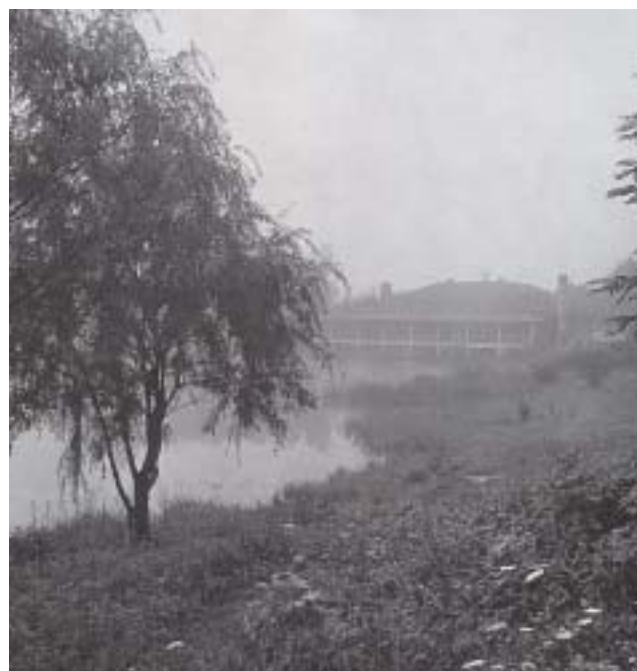
Black Mountain College dining hall and theatre on Lake Eden.