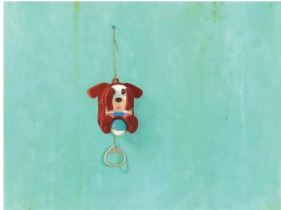
Christopher Clamp WITNESS 2008 Oil on Panel 18 x 24 inches