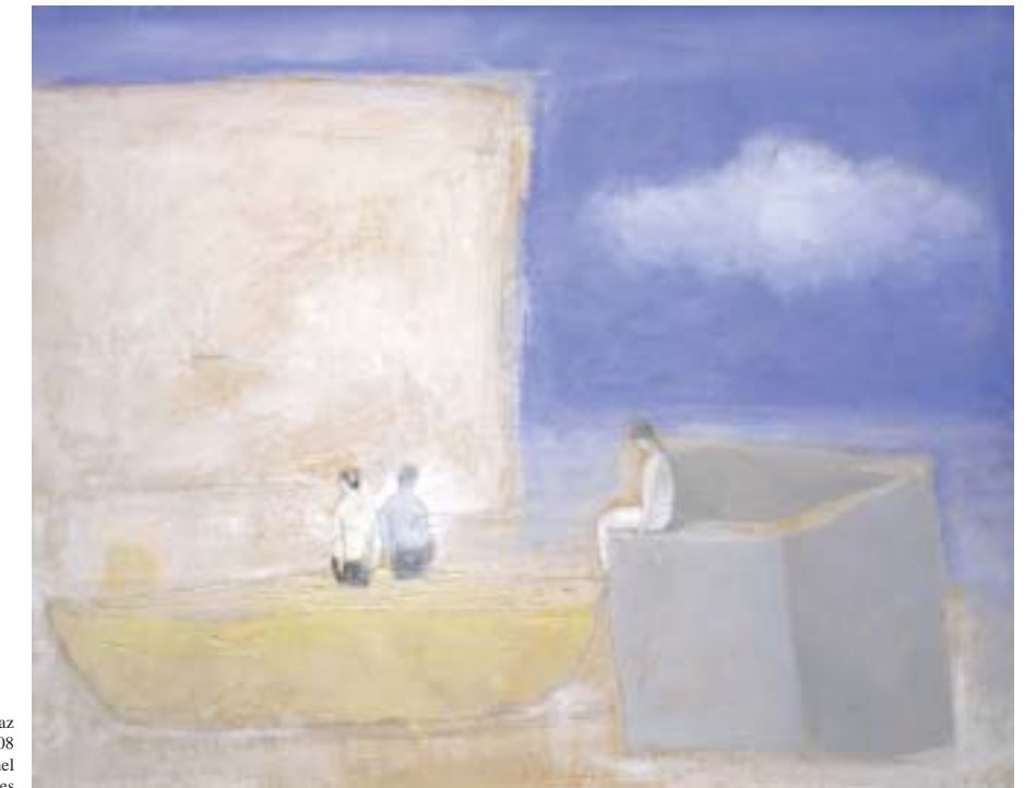
Raul Diaz LA NUBE 2008 Acrylic on Wood Panel 31 3/8 x 39 1/2 inches

Each of the 2008 Studio Editions are priced under $7,000 and come with a custom Plexiglas vitrine and a book about its particular form.