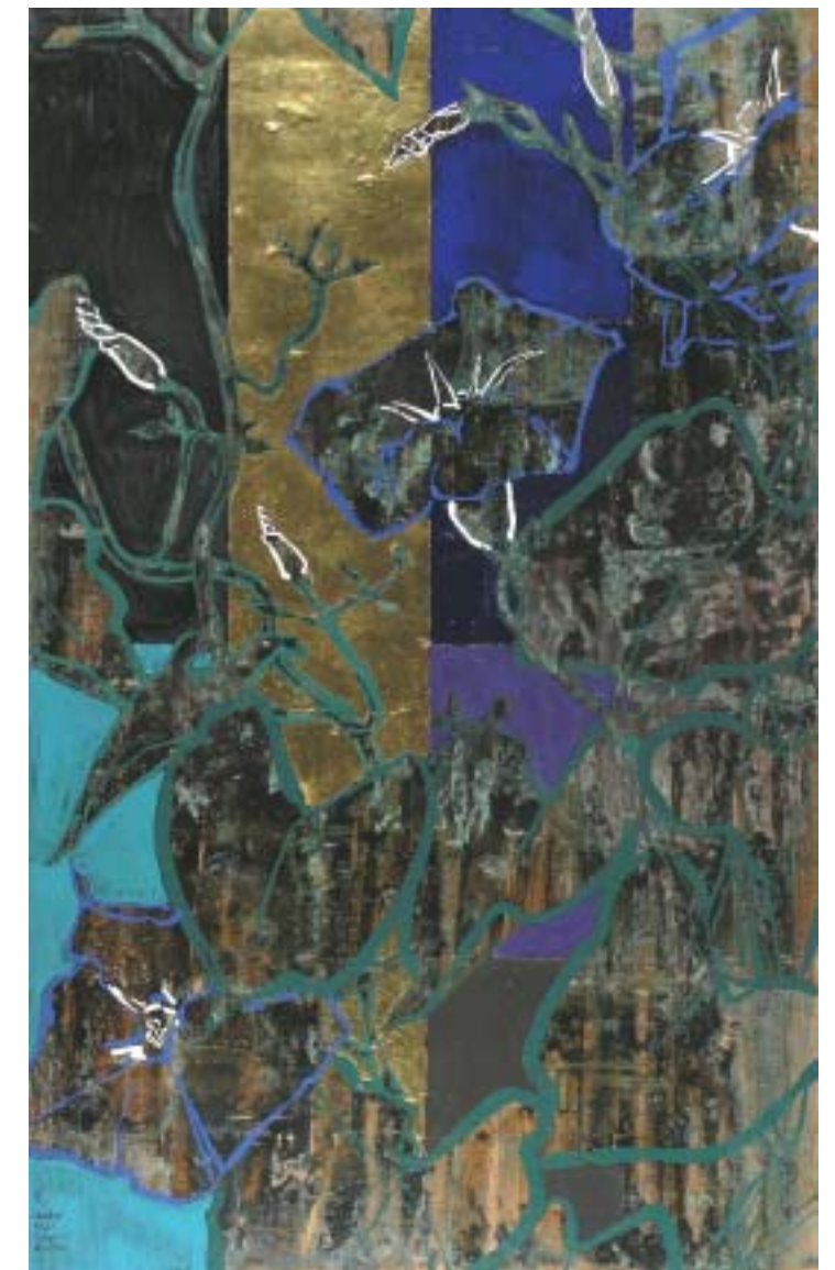
Robert Kushner, Celestial Blue I , 2007, Acrylic, Oil, Gold Leaf on Canvas, 48 x 30 inches

Garden Walk marks Robert Kushner's first solo exhibition with the gallery and will be on view from July 26 through September 6.