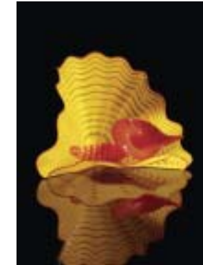
Phoenix Persian Pair