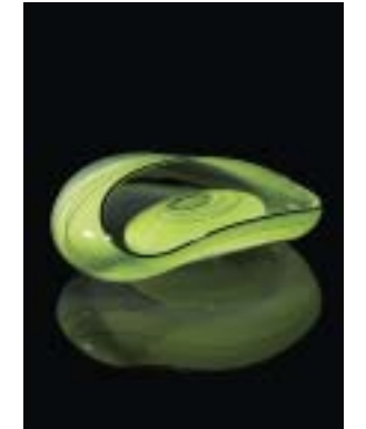
Vienna Green Basket Set