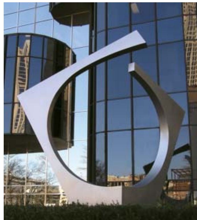
James Rosati, Two Angled Forms , 1983, Stainless Steel, 16'x20'x10' Charlotte Plaza Building, Charlotte, NC

Whether you live in Charlotte or just come to visit, please stop by the gallery and see what outstanding works of art we have to offer.