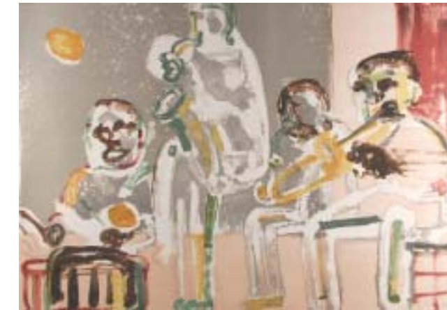
Romare Bearden, Tenor Sermon , 1979, Lithograph, 24 7/8 x 34 3/4 inches