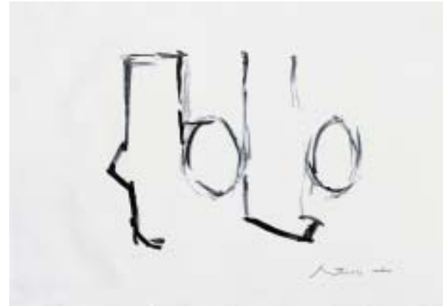
Robert Motherwell, Spanish Elegy II , 1975, Lithograph, 22 1/2 x 32 1/2 inches