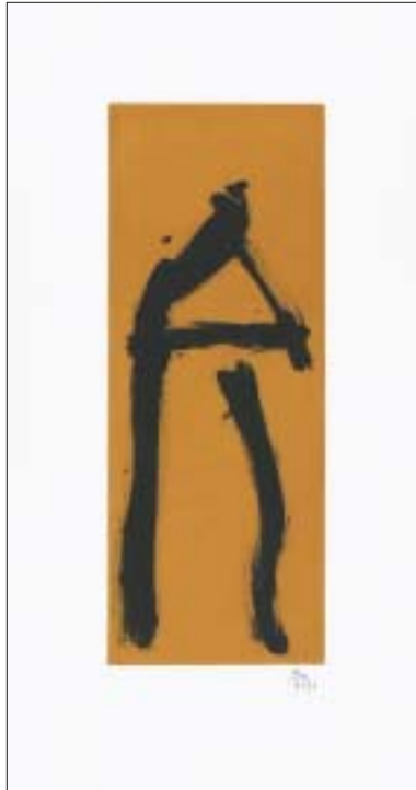
Robert Motherwell (1915-1991) BLACK GESTURE ON COPPER GROUND 1981 Etching and Aquatint 39 1/8 x 20 3/4 inches