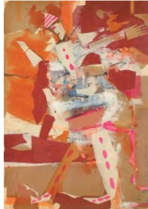
Romare Bearden (1911-1988) HARLEQUIN c. 1956 Collage of Various Papers with Paint, Ink, Graphite on Paper 24 5/8 x 17 1/2 inches