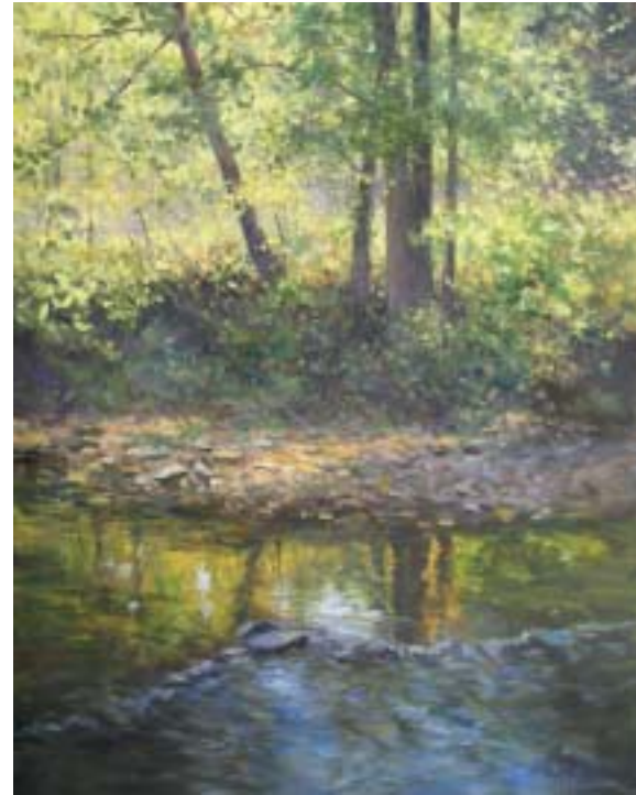
Thomas McNickle RIPPLING WATER 2008 Oil on Canvas 50 x 40 inches