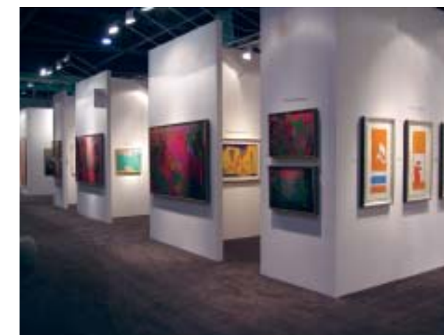
Jerald Melberg Gallery booth at Art Miami 2007.

Art Miami brings together nearly 100 galleries from 17 countries, many of which are leading, long-time experts in their areas of specialization. The strengths of the show lie in the quality and diversity of its offerings: contemporary work, modern masters and photography.