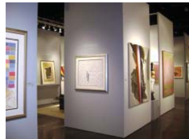
Jerald Melberg Gallery booth at PalmBeach2 2008.

The show will take place November 14 through 17 in the Park Avenue Armory. Please look for us in booth #B10. You may also view works by all our gallery artists anytime by visiting us online at www.jeraldmelberg.com .