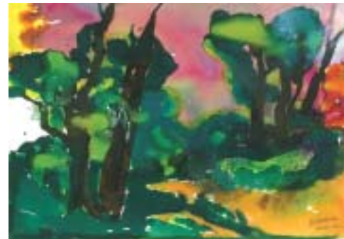
Romare Bearden (1911-1988) NEAR SHELBY ROAD 1986 Watercolor on Paper 10 x 14 inches