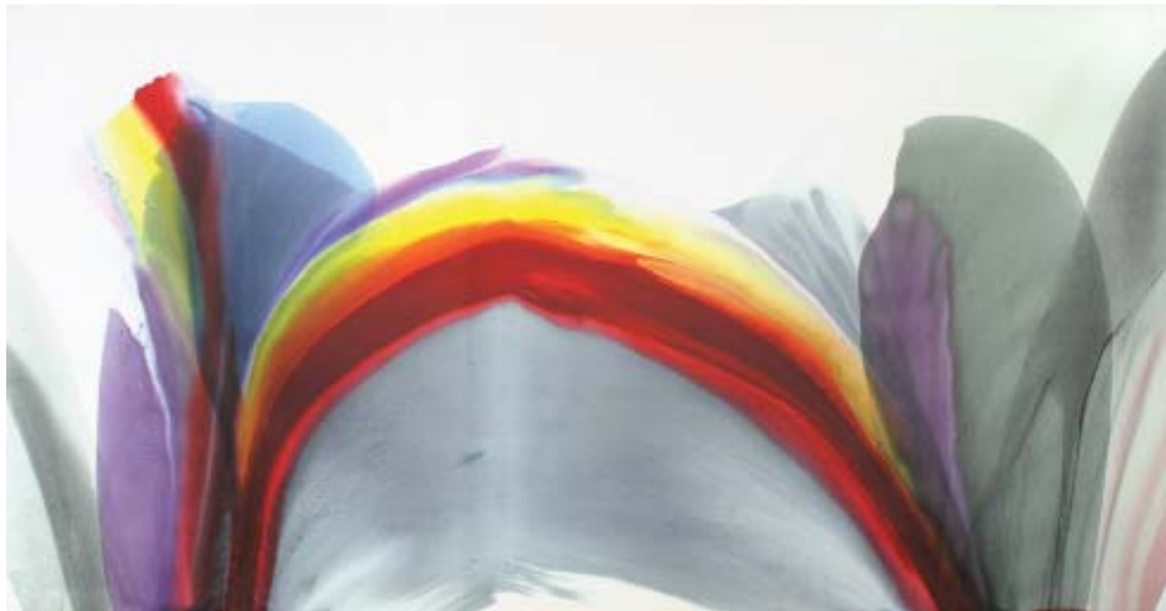
Below: Paul Jenkins PHENOMENA PALACE CHANGE 1975-76 Acrylic on Canvas 77 x 150 inches

625 SOUTH SHARON AMITY ROAD CHARLOTTE NC 28211 704.365.3000 704.365.3016 FAX M-SAT 10-6