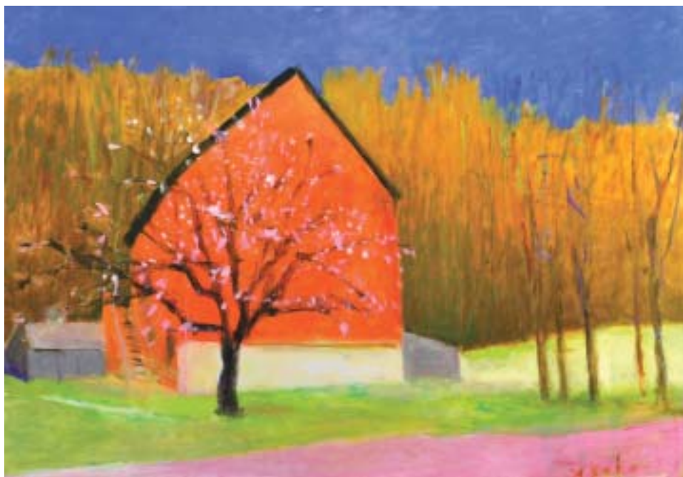
Wolf Kahn SOCLAIR BARN (LARGE VERSION) 2007 Oil on Canvas 36 x 52 inches