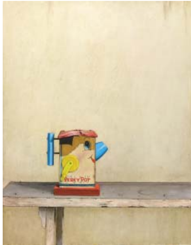
Christopher Clamp OVERHEAT 2007 Oil on Panel 18 x 14 inches