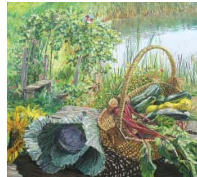
Janet Fish, GRAPE ARBOR , 2001, Oil on Canvas, 64 x 70 inches