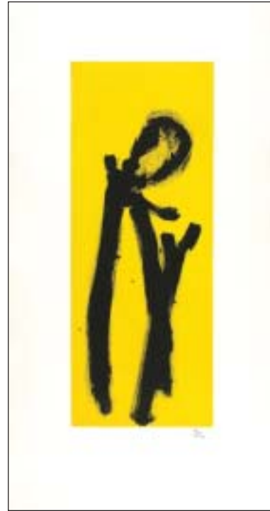
Robert Motherwell (1915-1991) YELLOW CHORD 1981 Etching & Aquatint 27 3/4 x 20 1/2 inches (image) 38 3/4 x 20 1/2 inches (paper)