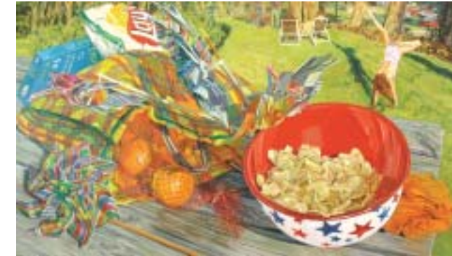
Janet Fish, CARTWHEEL , 2000, Oil on Linen, 42 x 75 inches