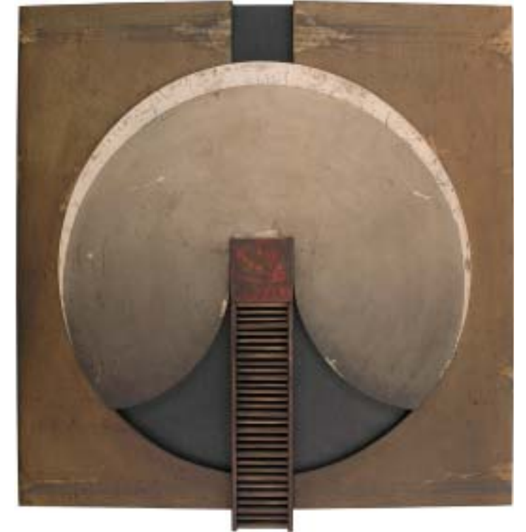
Ramon Urbán SIGNO INCIERTO 2006 Mixed Media on Wood Construction 41 x 39 1/2 inches