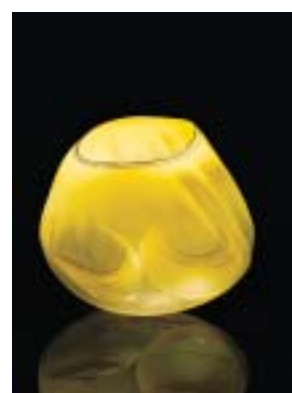
Honeysuckle Yellow Basket Set