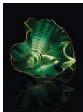
Celtic Emerald Persian Pair

JERALD MELBERG GALLERY 625 South Sharon Amity Road Charlotte, NC 28211 FINE ART DEALERS ASSOCIATION MEMBER FADA