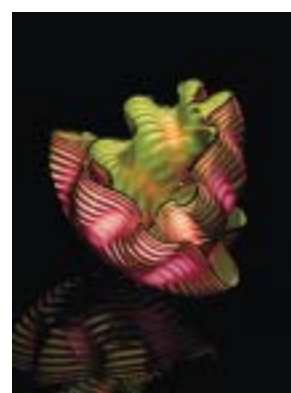
Royal Raspberry Seaform Pair

2007 Portland Press Studio Editions by Dale Chihuly.