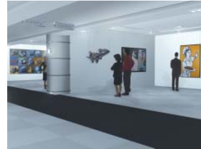
Artist's impression of the gallery space aboard the luxury yacht, Grand Luxe.

After the September/October leg of SeaFair's east coast tour, Jerald Melberg Gallery will board the Grand Luxe again in Miami Beach, November 30 - December 9, 2007.