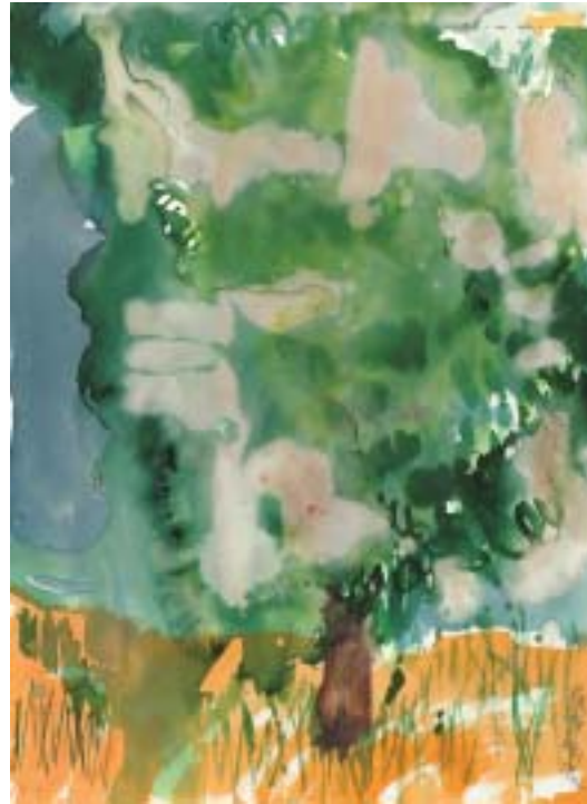
Romare Bearden (1911-1988) SUNSET TREE- NEAR GRAND CASE 1988 Watercolor on Paper 27 1/2 x 20 1/4 inches