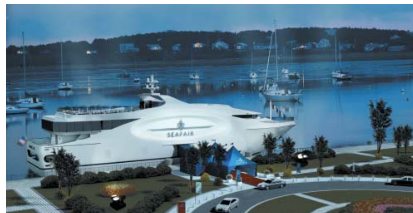
Artist's impression of the luxury yacht, Grand Luxe.

THE CAROLINAS' PREEMINENT GALLERY FOR CONTEMPORARY ART