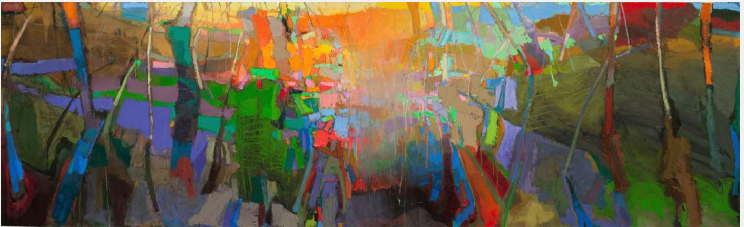
Brian Rutenberg BLUE POINT 2008-09 Oil on Linen 48 x 158 inches

NORTH CAROLINA'S PREEMINENT GALLERY FOR CONTEMPORARY ART