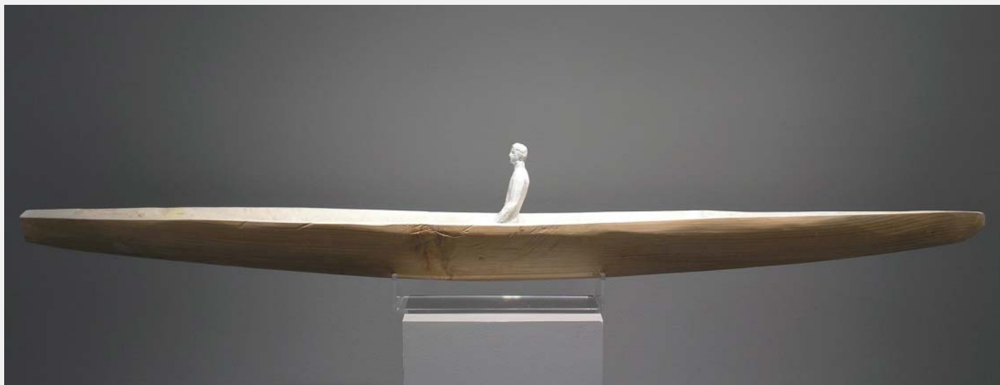
Raul Diaz BOTE LARGO I 2008 Bronze and Carved Wood 11 3/4 x 74 3/4 x 6 inches