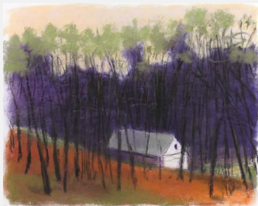
Wolf Kahn HEAVILY INTO VIOLET II 2008 Pastel on Paper 20 x 25 inches