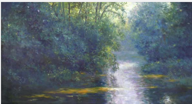
Thomas McNickle SUNLIGHT ACROSS THE SOUTH YADKIN (NEAR STATESVILLE) 2009 Oil on Canvas 38 x 72 inches