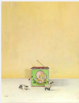
Christopher Clamp SLEEPLESS 2008-09 Oil on Panel 24 x 18 inches