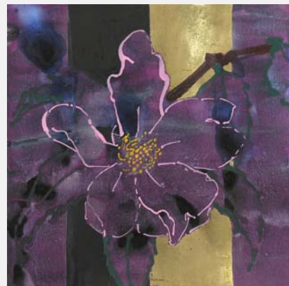
Robert Kushner PINK CAMELLIA I 2009 Acrylic, Gold Leaf on Rag Paper 13 7/8 x 13 7/8 inches