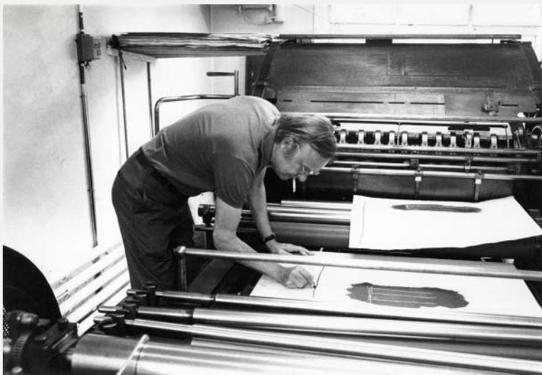
Robert Motherwell drawing on lithographic stone for Lines of St. Gallen , 1971.