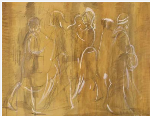
Isabel Bishop (1902-1988) SKETCH FOR SIX WOMEN WALKING 1963 Oil on Canvas 23 1/2 x 30 1/2 inches