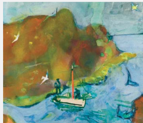
Romare Bearden (1911-1988) OFF THE NORTH SHORE 1987 Watercolor and Collage on Paper 11 x 12 3/4 inches