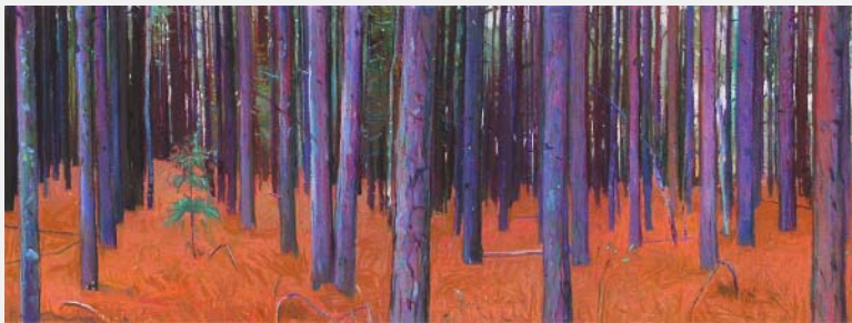
Charles Basham PINE FOREST NEAR SWANSEA 2009 Pastel on Paper 11 1/4 x 30 inches