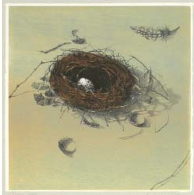
Carol Mothner ONLY CHILD 2002 - detail Monoprint 9 x 9 inches (image) 30 x 22 inches (paper)