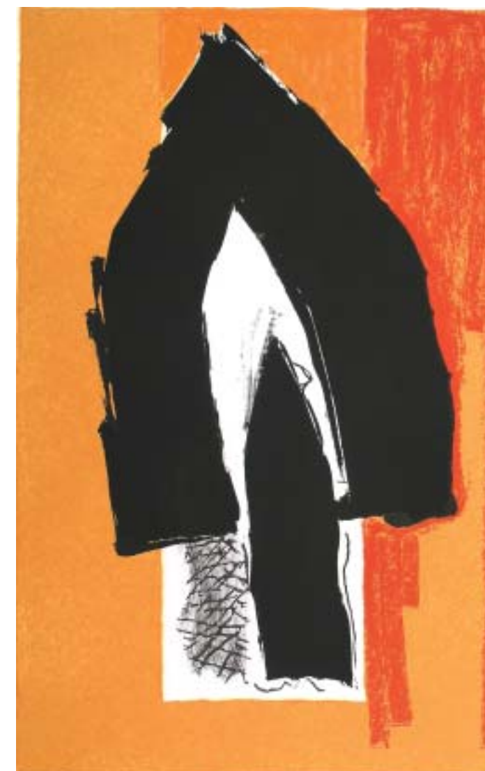
Robert Motherwell, Black Cathedral , 1991, Lithograph, 67 x 47 inches © Copyright 1991 Dedalus Foundation, Inc./Licensed by VAGA, NY