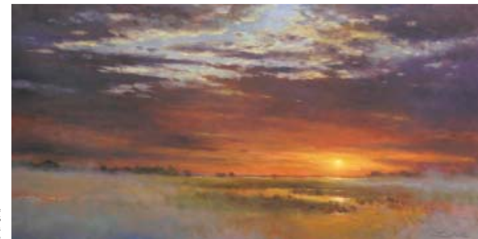
Thomas McNickle EVENING MIST 2006 Oil on Canvas 29 1/2 x 59 1/2 inches