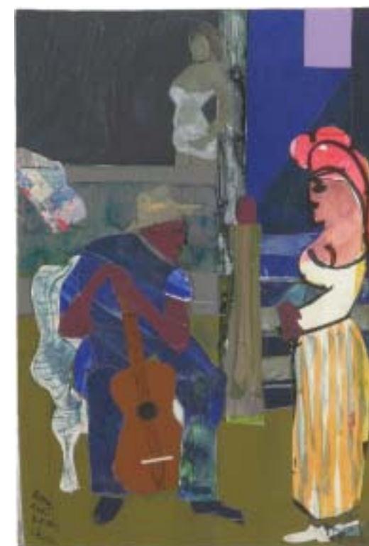
Romare Bearden BLUES MAN FROM UP-COUNTRY 1985 Collage on Board 12 x 8 1/8 inches