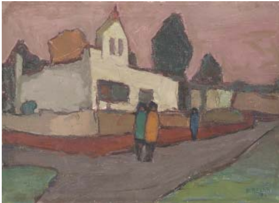
Manuel Reyna CAPILLA PARTICULAR 1974 Oil & Mixed Media on Board 7 3/8 x 10 1/4 inches