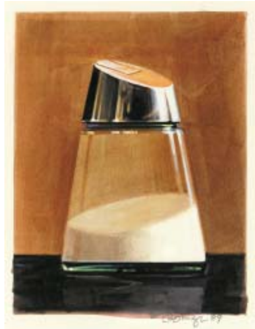
Ralph Goings SUGAR DISPENSER 1989 Watercolor & Gouache on Foamcore 4 x 3 inches