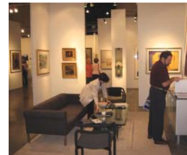
Jerald Melberg Gallery booth at PalmBeach 3 2006.

The Los Angeles Art Show's outstanding reputation is based on the high quality and variety of fine art presented by a carefully selected group of galleries. All works are vetted for authenticity by authorities in the fields represented at the show. Vetting is made possible by sponsorship from FADA.