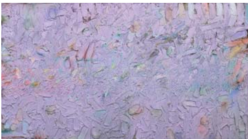
Top: Stanley Boxer SUMMONSFROMTHEMILD 1991 Oil and Mixed Media on Wood 5 3/4 x 9 7/8 inches