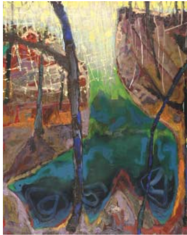
Brian Rutenberg DEEP RIVER 2 2002 Oil on Canvas 48 x 38 inches