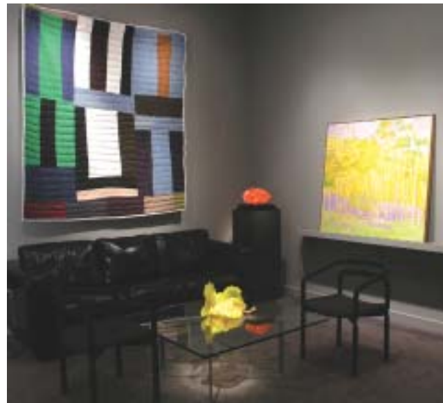
Gallery installation photo.

The exhibition, which will be accompanied by a full color catalogue, will also travel to the Hickory Museum of Art in Hickory, North Carolina next spring.