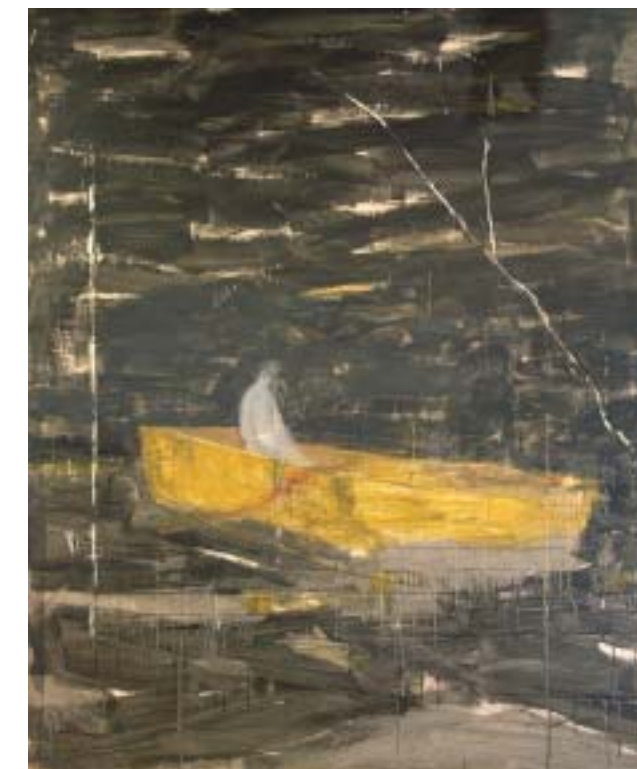
Raul Diaz EL MARI 2006 Acrylic on Wood Panel 72 x 59 inches