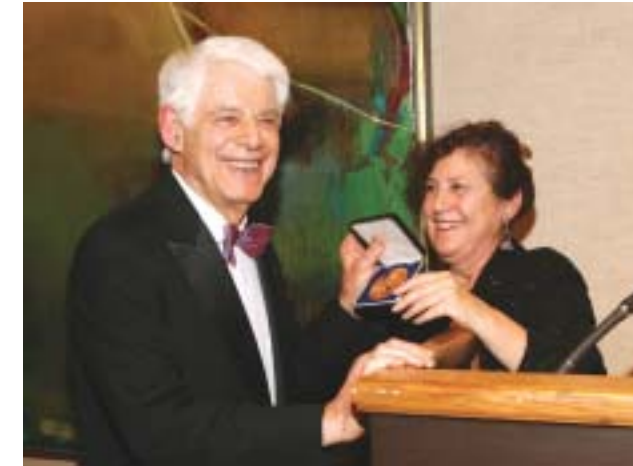
National Academy Museum's Spring Gala 2006 Wolf receives Lifetime Achievement award from Academy President Susan Shatter.

The gallery maintains an extensive inventory of oils and pastels by Wolf, a selection of which may be viewed anytime on our web sites: www.wolf-kahn.com and www.jeraldmelberg.com .