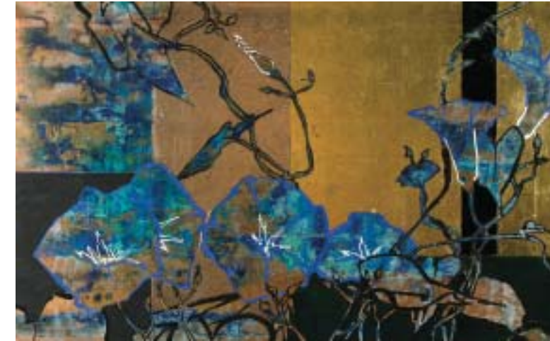
Robert Kushner, CELESTIAL BLUE III , 2007, Acrylic, Oil & Gold Leaf on Canvas, 30 x 48 inches

Kushner has exhibited extensively, and his work can be found in the collections of many prestigious institutions, including the Museum