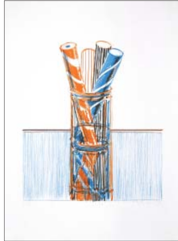
GLASSED CANDY 1980 Color Lithograph on Paper 30 x 22 inches