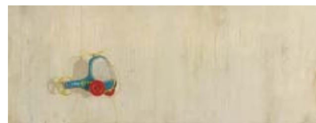
Any Where But Here, 2003-04, Oil on Panel, 14 x 36 inches