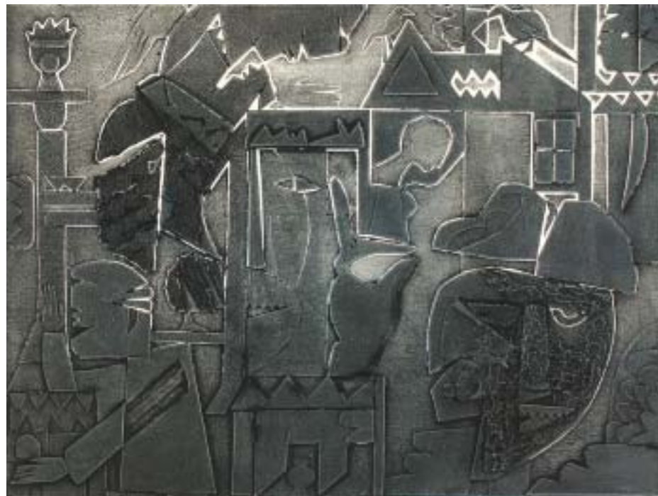
Romare Bearden UNTITLED c. 1969-70 Unique Collagraph 19 x 24 3/4 inches (paper)