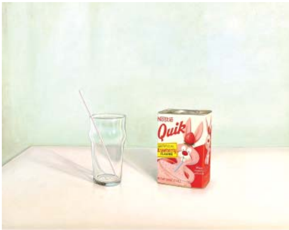
Christopher Clamp SUGAR 2007 Oil on Panel 16 x 20 inches

© copyright 1985 Dedalus Foundation, Inc./Licensed by VAGA, NY