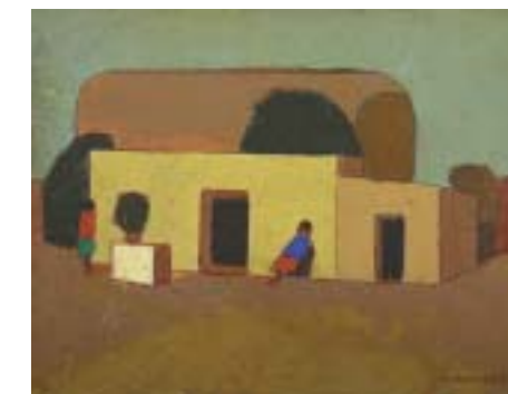
Manuel Reyna, GAPONES A ORILLAS DEL SUGUIA , 1989 Oil & Mixed Media on Board, 9 3/8 x 11 7/8 inches