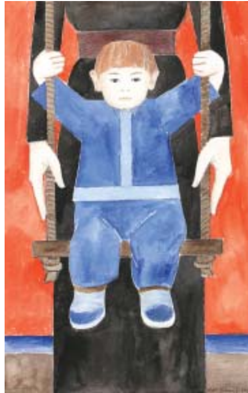
THE SWING 1984 Watercolor on Paper 34 x 18 inches