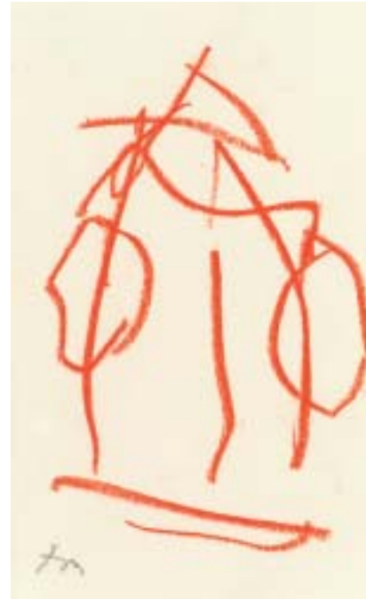
Robert Motherwell (1915-1991) UNTITLED (from the Joyce Sketchbook) 1985 China Marker on Paper 5 x 3 inches