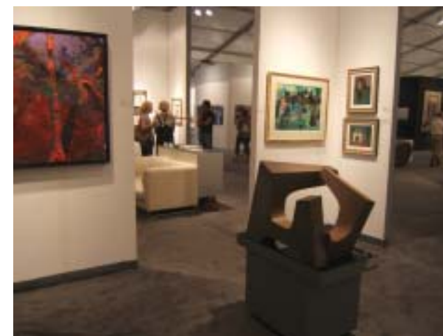
Jerald Melberg Gallery booth at Art Miami 2007.

The show will take place November 14 through 17 in the Park Avenue Armory. Please look for us in booth #B10. You may also view works by all our gallery artists anytime by visiting us online at www.jeraldmelberg.com .