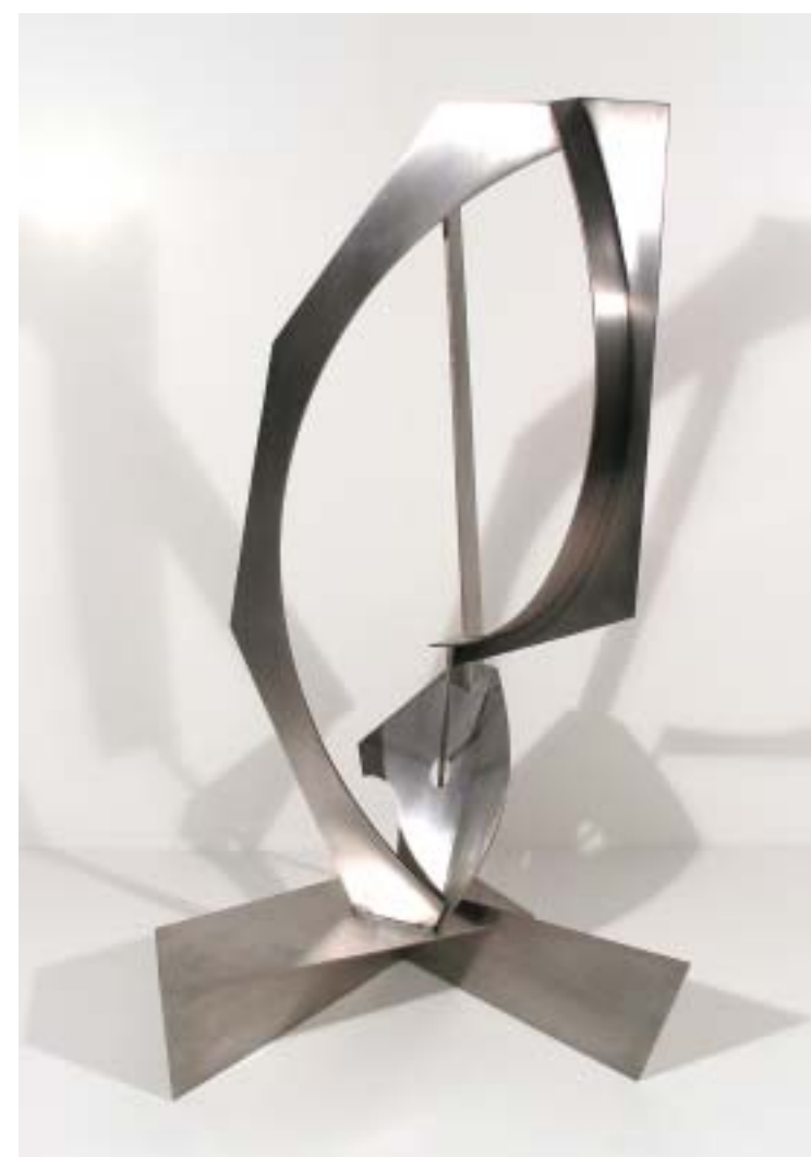
Ode V, 1980-81, Stainless Steel, 46 x 22 1/2 x 20 1/2 inches

It should be like a great piece of music: every time you play it, you're astounded by it, you're hit by it the first time because of a particular sound, the chemistry of your ears, and so on, and the sound is perfect, but every time you play it, it shows you more.