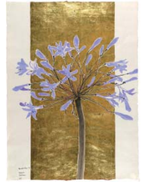
Robert Kushner AGAPANTHUS IV 2007 Ink, Oil & Gold Leaf on Japanese Paper 34 1/2 x 25 3/4 inches