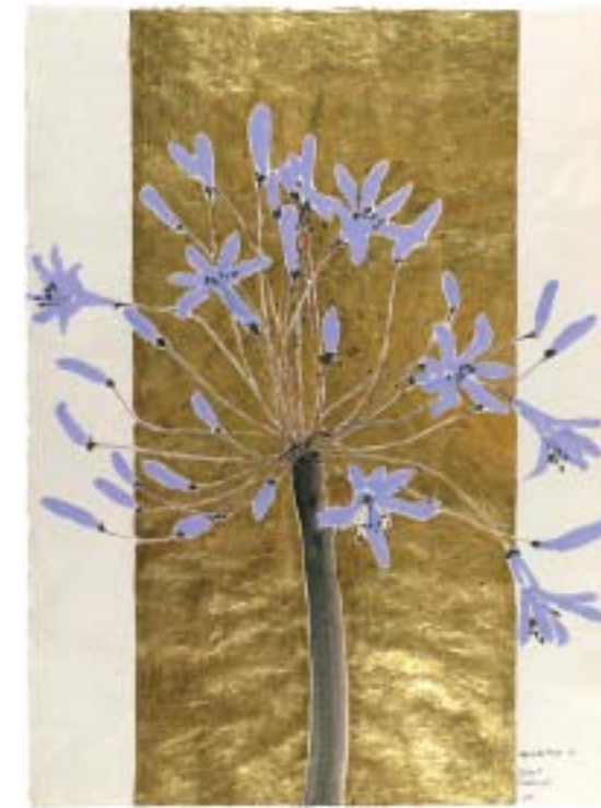
Robert Kushner AGAPANTHUS III 2007 Ink, Oil, Gold & Silver Leaf on Japanese Paper 34 3/4 x 25 1/2 inches