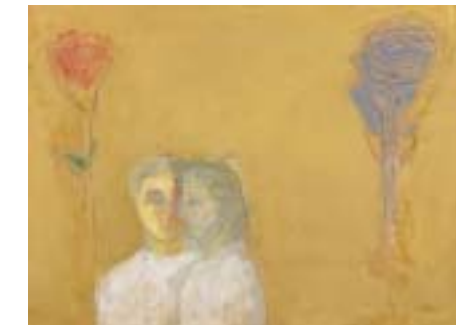
Raul Diaz, FIGURA EN EL AGUA , 2004 Acrylic on Wood Panel, 35 7/8 x 23 5/8 inches

To view a selection of works by both of these artists, please visit our web site at www.jeraldmelberg.com .