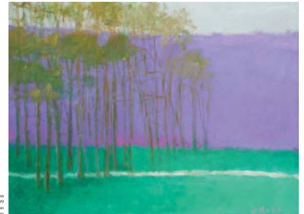
Wolf Kahn MAGENTA GLOW AT FOREST'S EDGE 1999 Oil on Canvas 26 x 35 inches