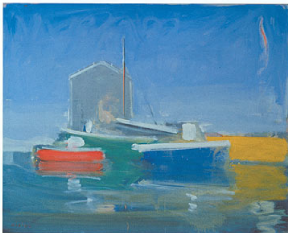
CLEAR MORNING, 1994-95, OIL, 51 x 64 INCHES

"After I returned to New York, I lived on Washington Square North, near the Cedar Bar. All the artists who came over to my studio and saw these