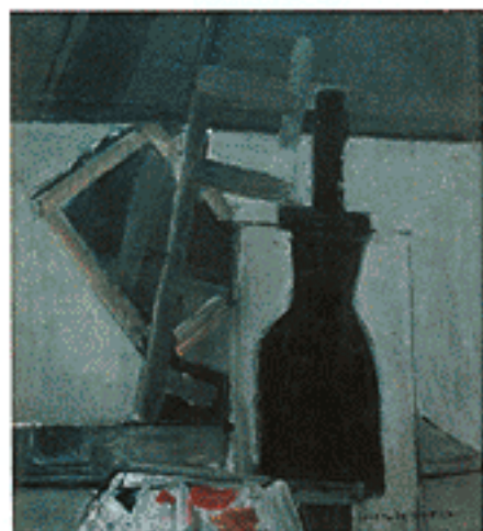
LEFT TO RIGHT: JOSEPH DE MARTINI, UNTITLED , OIL ON PANEL, 13 x 12 INCHES; ALFRED RUSSELL, WAVE-CORPUSCULAR-MOVEMENT , 1951, OIL, 44 x 30 INCHES; DAVID BURLIUK, PORTRAIT OF ARSHILE GORKY , 1932, PENCIL, PASTEL AND INK, 12 x 9 INCHES.